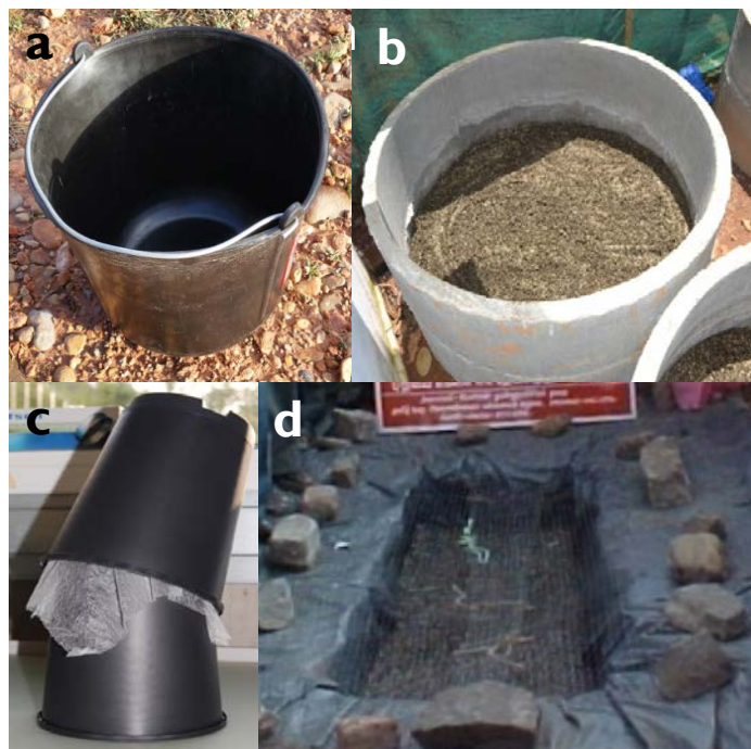
Different types of propagation units: container (a), concrete (b), pot (c) and ground unit (d)

The container unit consists of a plastic beaker with holes at the bottom (to allow water passage), the pot unit of two pots with a garden fleece in between (to prevent inoculate leakage), the concrete unit consists of a tank made e.g. from cement or PVC tubes and the ground unit is a hole in the ground covered with a strong plastic foil and a PVC board to prevent roots passing the plastic. Beaker and pot units should be placed on a stony surface, wood or a saucer to prevent roots growing through. Units can be placed in the shade house or should be fenced to prevent animals feeding on host plants and wind to carry unwanted particles into the system.